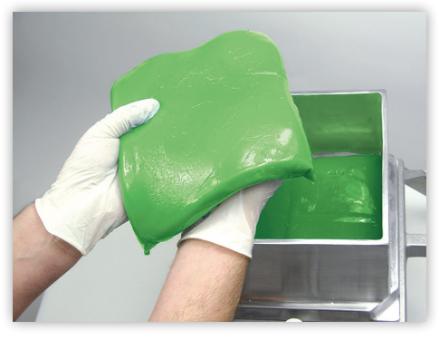
Place up to four gel squares into the Gel Cutting Device hopper.