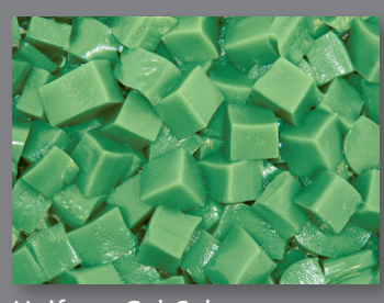
Uniform Gel Cubes