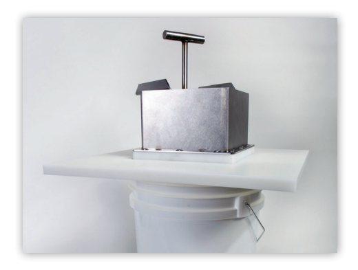
Set up the Gel Cutting Device on the Cutting Board placed over a bucket or storage container.