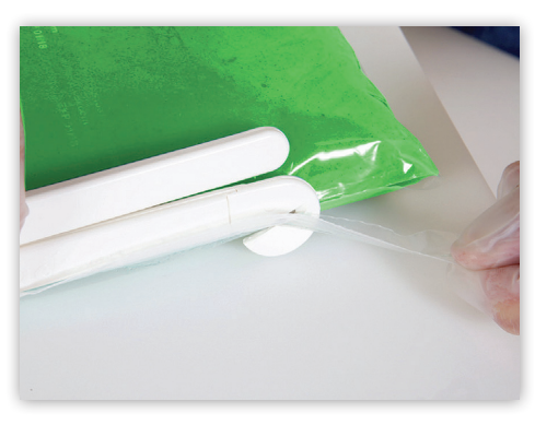
Using a Pouchmate opener, slice the pouch open and remove the gel square.