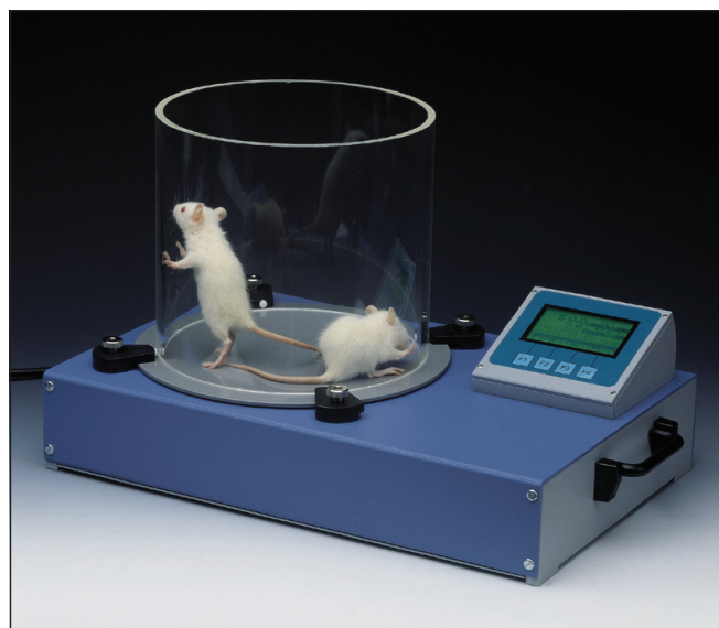
Figure 1. The hot plate test. Note that one animal is licking its paw, a behavior that signifies completion of the test.

When an investigator initially begins using the hot plate test, and when first assessing a new strain of animal, care must be taken to identify the appropriate amount of stimulus (i.e., temperature of surface) that will produce the desired response (i.e., paw lick or jumping). One should also assess the effects of a reference analgesic such as morphine to determine that the planned hot plate temperature will result in the desired sensitivity (2).