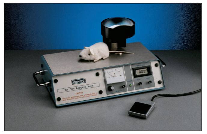
Figure 2. The tail flick test. The rat in the figure shows the placement of the tail under the light beam. When the tail moves out of the beam, a photocell is activated, and the light and timer both stop. The foot pedal is used to start the test.

set of hairs consists of 20 filaments. The test is performed by placing an animal on an elevated platform with a surface of wire mesh. The Von Frey hair is then inserted perpendicularly from below the platform, up through the wire mesh and into the plantar surface of the hind paw. Starting with the smallest gauge filaments, each filament is applied to the skin of the paw. The pressure is increased slowly, until the hair just begins to bend. The test is then repeated with the next largest gauge filament until the animal shows a withdrawal response by quickly flicking the paw away from the hair. This may also be followed by lifting the paw, licking it and possibly vocalizing. The outcome measure of the test is the withdrawal threshold, defined as the smallest gauge wire that produced a withdrawal response (2, 5).