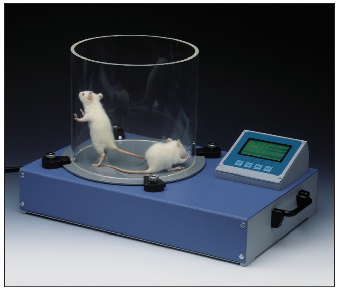
Figure 1. The hot plate test. Note that one animal is licking its paw, a behavior that signifies completion of the test.

When an investigator initially begins using the hot plate test, and when first assessing a new strain of animal, care must be taken to identify the appropriate amount of stimulus (i.e., temperature of surface) that will produce the desired response (i.e., paw lick or jumping). One should also assess the effects of a reference analgesic such as morphine to determine that the planned hot plate temperature will result in the desired sensitivity (2).